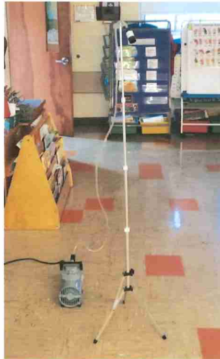
Typical PCM Air Sample Set-up